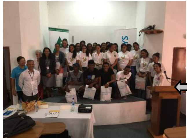
JA Success Skills and JA Mini Company was implemented for the first time in Rodrigues.