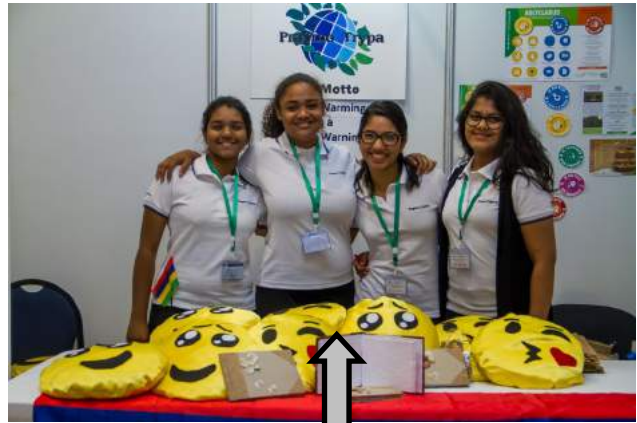
PraSino Trypa flew the Mauritian flag high in Zimbabwe, with a first runner-up finish at the JA Africa Regional Company of the Year Competition 2016.