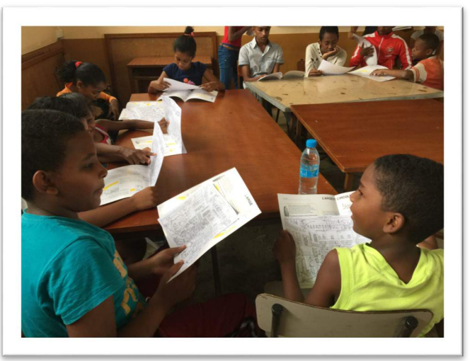
Why "JA Notre Quartier" from Junior Achievement Mascareignes?

During a sensitization workshop, some representatives from Junior Achievement Mascareignes came to this lecture to make a brief representation of the program "JA Notre Quartier". After this presentation, some volunteers expressed the desire to be part of the project. We wanted to bridge the gap between the elders and the teenagers. Moreover, the program appeared to be an accessible way for us to address issues in our locality with youth. "JA Notre Quartier" appeared to deal with some fundamentals aspects of life: Social, Economical, Political.