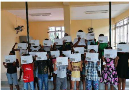
Implementation of JA Programs with other NGOs