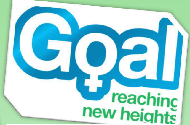
Extension of the partnership between JA Mascareignes and Women Win for the GOAL Project