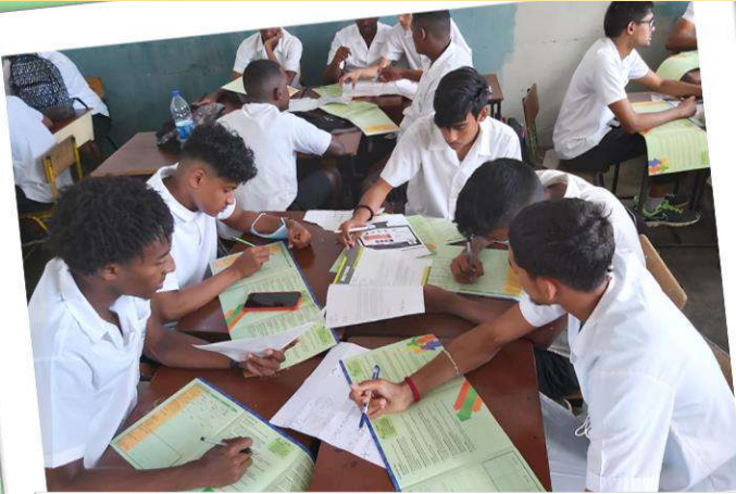
Use of “digital tools” in the delivery of JA Career Success in the classroom.