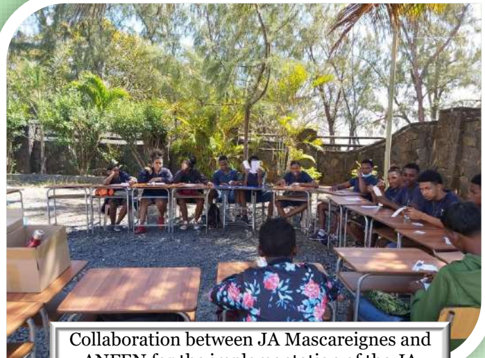
Collaboration between JA Mascareignes and ANFEN for the implementation of the JA Notre Quartier Program